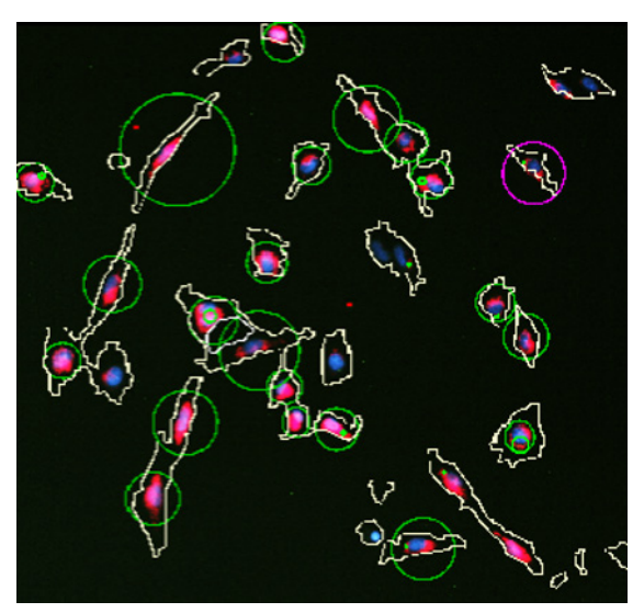
Overlay fluorescence images (nuclei, mitochondria & golgi)

Mitochondria in Fluo CH1 (red fluorescent, dark green labeled) and Golgi in Fluo CH2 (green fluorescent, bright green labeled) detection in a viable cell layer (light yellow labeled in brightfield image). Pink circles mark fluorescence in CH1, red circles CH2 Fluorescence outside detected cells in BF.