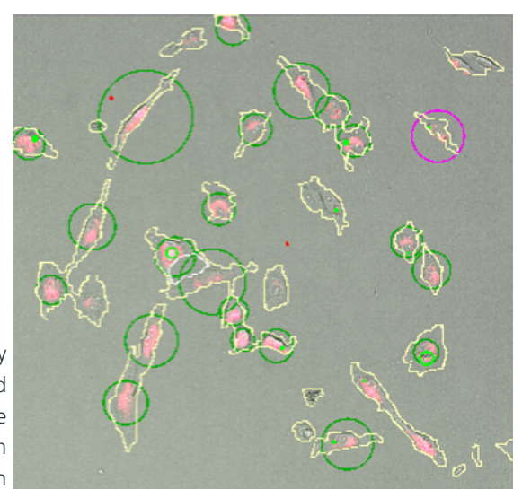
Overlay brightfield and fluorescence images with detection